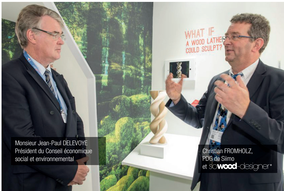
Monsieur Jean-Paul DELEVOYE Président du Conseil économique social et environnemental