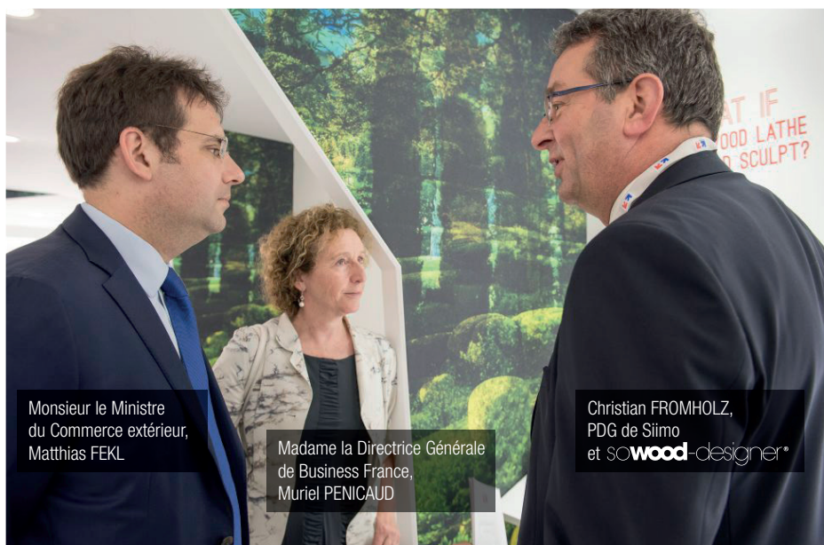
Monsieur le Ministre du Commerce extérieur, Matthias FEKL